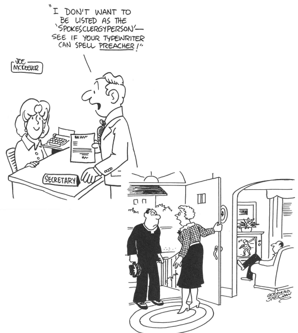
"NO, GEORGE WASN'T SICK. HE WAS WORSHIPING THE HOUSEHOLD IDOL."