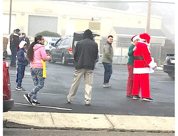
Santa was on hand to help direct traffic. The auto line extended down the street and around the corner.

Galt Sunrise Rotary teamed up with Sunshine Pantry to distribute Christmas Dinner Boxes and toys to residents of the Galt Community.