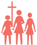
United Women in Faith

Thursday, January 19, 9:30am: in person and ZOOM.