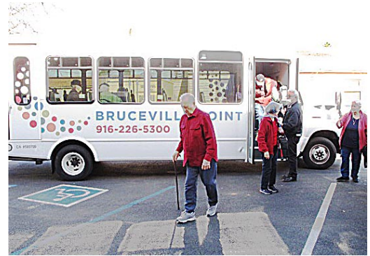
The bus from Bruceville Point arrived carrying nine residents for the Bible study on Ruth.