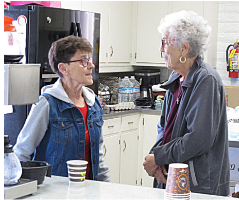
The editor sat in on the Bruceville/ Galt Bible study last Tuesday - - -