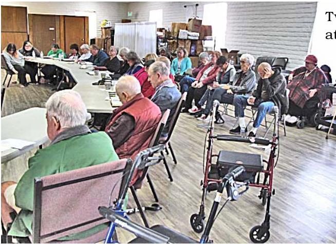
Twenty-six people attended the Study